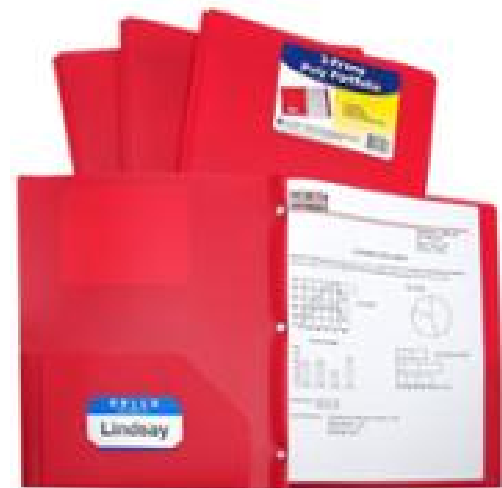
plastic folder with pockets & prongs