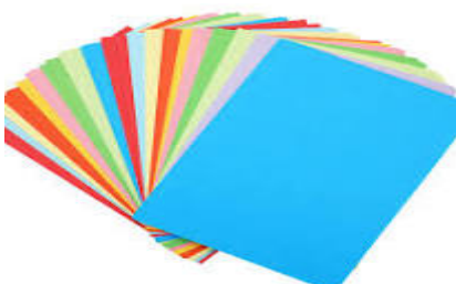
Assorted colored printing paper