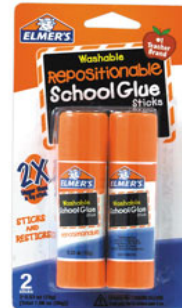
Elmer's glue sticks