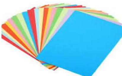
Assorted colored printing paper