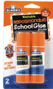
Elmer's glue sticks