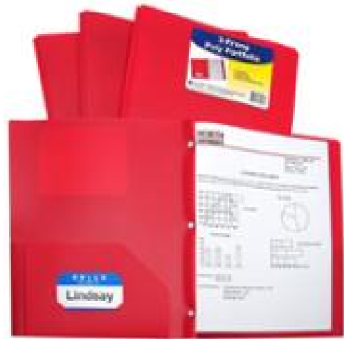
plastic folder with pockets & prongs