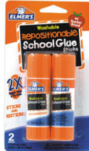
Elmer's glue sticks