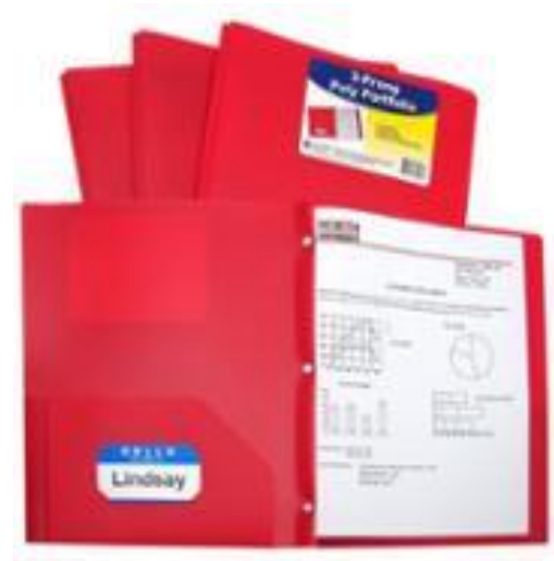
plastic folder with pockets & prongs