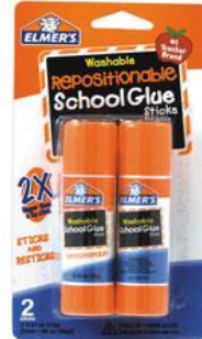
Elmer's glue sticks